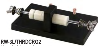
RW-3L/THRDCRG2 New dual thread-dual tension carriage