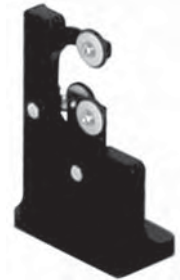
RW-1L/CHK-SPT New adjustable rod support for high speed rod turning