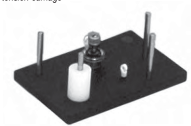
RW-1/CARRIAGE Standard 4-spool carriage can hold one 4 oz. spool