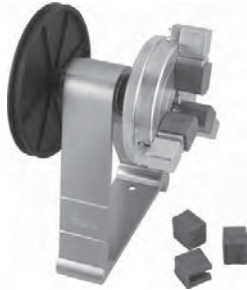
RW/DX-CHK Upgrade your RW-1L & RW-3L to the Pro Level