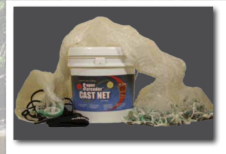
(3/16" Clear Mono) All models packed 2 per case