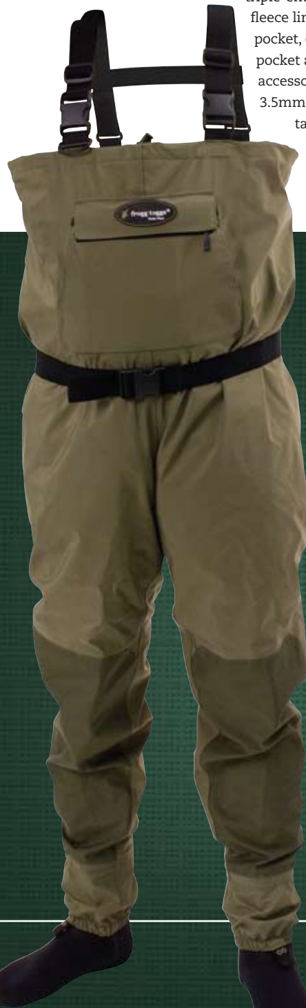
Hellbender™ Microfiber Breathable Stockingfoot Wader