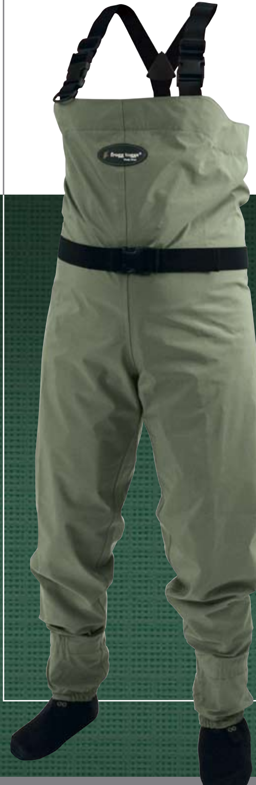
Canyon™ Women's Breathable Wader

Color: Patina Sage Women's Sizes: SM - XL