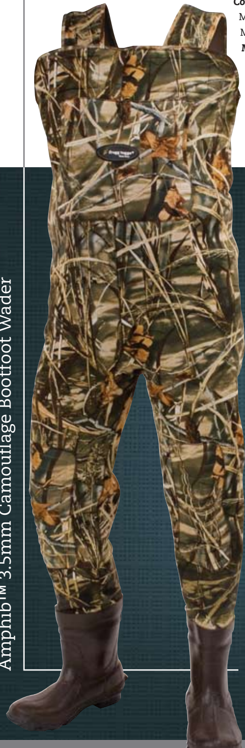
Amphib™ 3.5mm Camouflage Bootfoot Wader

Colors: Advantage Max4™ camo or Mossy Oak Breakup™ Men's Boot Sizes: 7 - 13