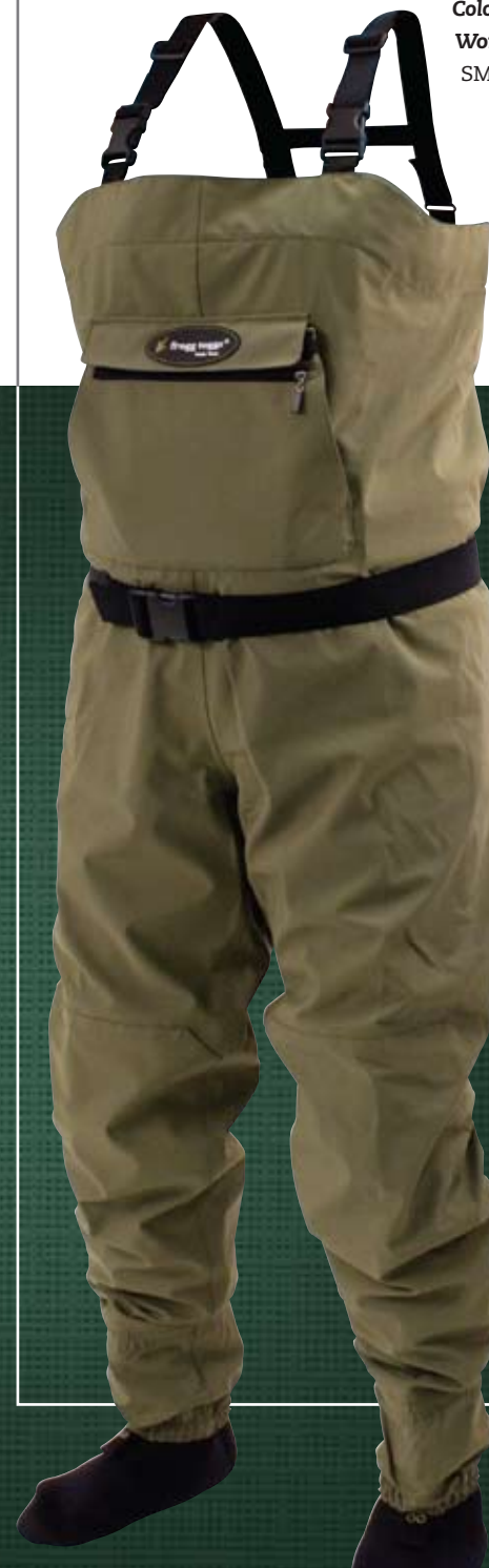
Hellbender™ Women's Breathable Wader