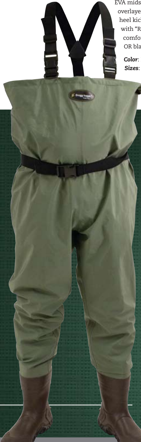
Canyon™ Taslan Breathable Bootfoot Wader

Color: Patina Sage Sizes: 8 - 13 (whole sizes only)