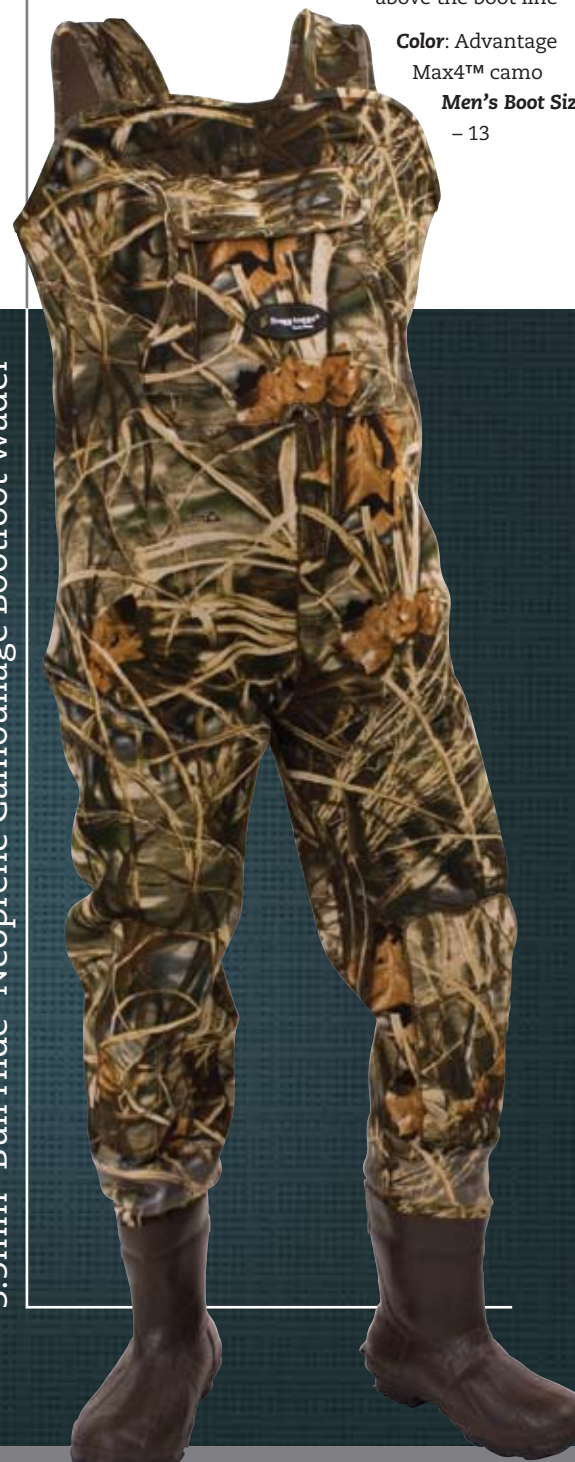
MarshTogg™ 3.5mm "Bull Hide" Neoprene Camouflage Bootfoot Wader

Color: Advantage Max4™ camo Men's Boot Sizes: 7 - 13