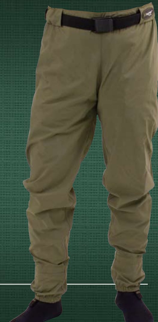
Hellbender™ Microfiber Breathable Stockingfoot Guide Pant