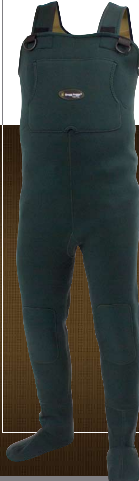
Amphib™ Neoprene Stockingfoot Wader

Color: Forest Green Men's Sizes: SM - XXL