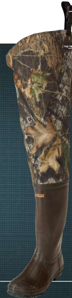
BoggTogg™ Camouflage Bootfoot Hip Wader

Color: Advantage Max-4 or Mossy Oak Breakup Men's Boot Sizes: 7 - 13