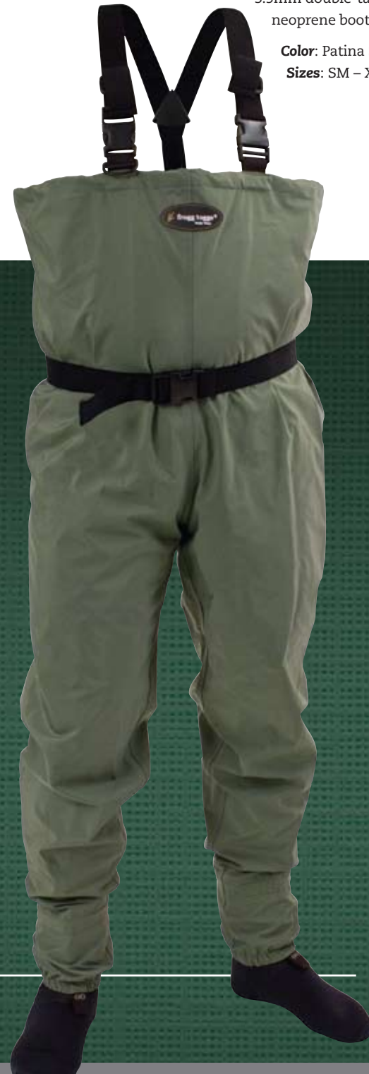
Canyon™ Taslan Breathable Stockingfoot Wader