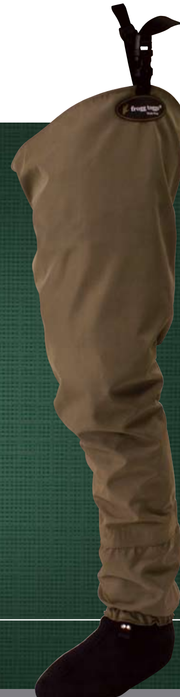
Rana™ Microfiber Breathable Stockingfoot Hip Wader