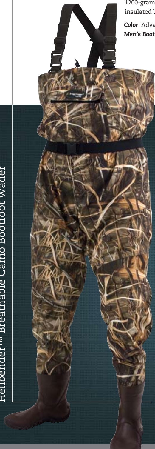
Hellbender™ Breathable Camo Bootfoot Wader

Color: Advantage Max-4 Men's Boot Sizes: 7 - 13