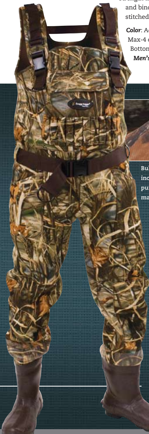
BullTogg™ 5mm "Bull Hide" Neoprene Camouflage Bootfoot Wader

Color: Advantage Max-4 or Mossy Oak Bottomland Men's Boot Sizes: 7 - 13