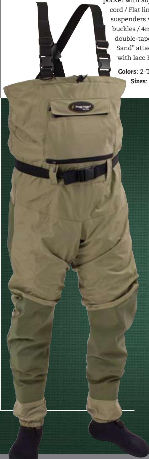
Pilot™ Microfiber Breathable Stockingfoot Wader

Colors: 2-Tone Limestone/Sage Sizes: SM – XXL