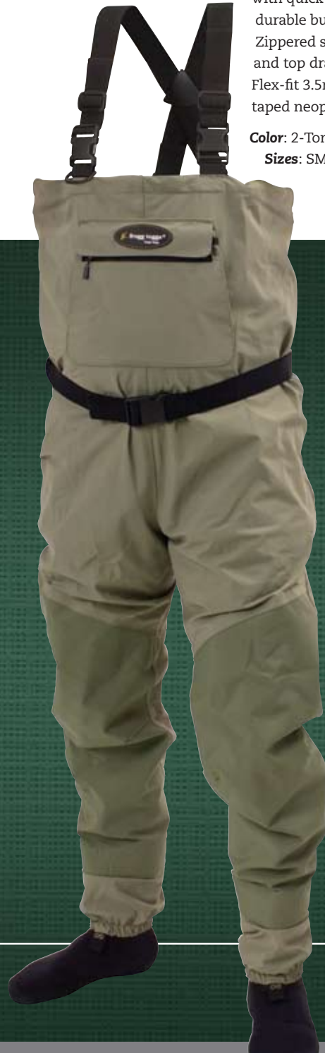
Anura™ Togg Reinforced Nylon Breathable Stockingfoot Wader