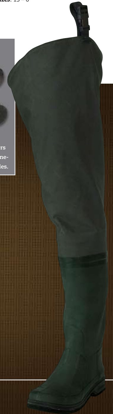
Cascades™ 2-Ply Poly/Rubber Hipper

Cascades waders and hip waders are available in both non-slip one-piece felt and sturdy cleated soles.