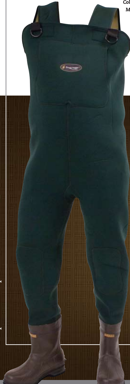
Amphib™ Neoprene Bootfoot Wader