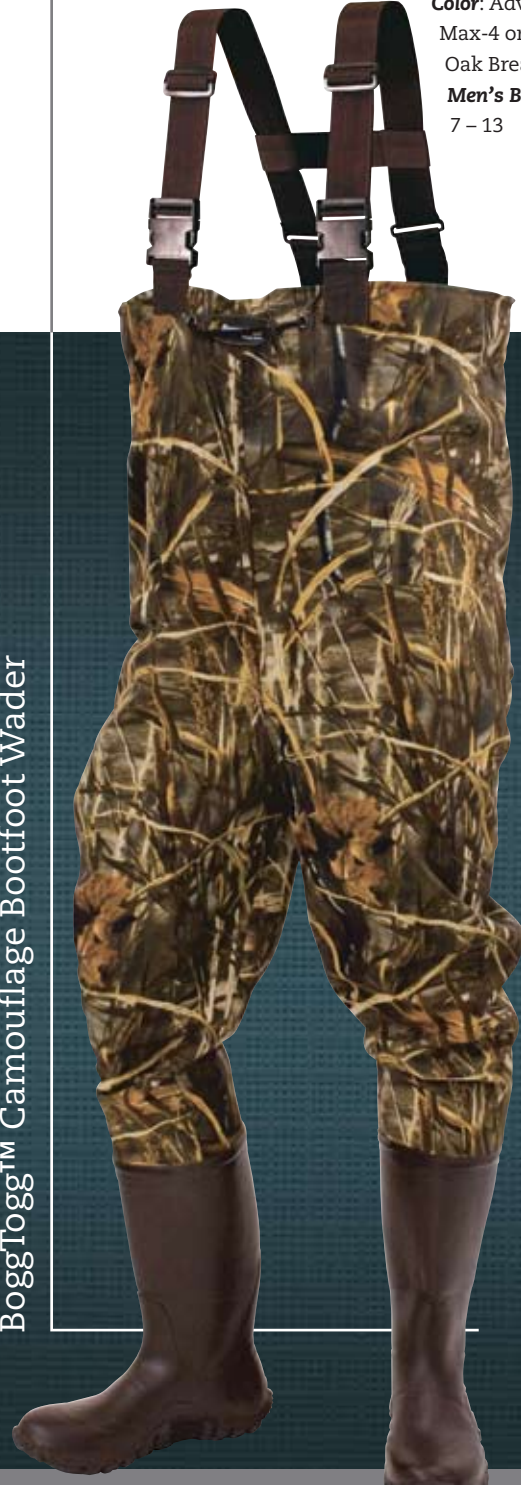
BoggTogg™ Camouflage Bootfoot Wader

Color: Advantage Max-4 or Mossy Oak Breakup Men's Boot Sizes: 7 - 13