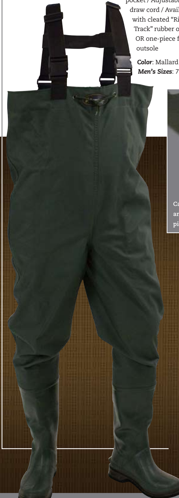
Cascades™ 2-Ply Poly/Rubber Bootfoot Wader

Ultra tough 2-ply 300 Denier poly/rubber upper / Classic design with tough "FT-Lite" vulcanized rubber technology / All seams stitched, taped and vulcanized / Attached, adjustable webbing suspenders with quick release buckles / Durable light-insulated rubber boots with steel shank / Inside security pocket / Adjustable chest draw cord / Available with cleated "Rip Track" rubber outsole OR one-piece felt outsole Color: Mallard Green Men's Sizes: 7 - 13